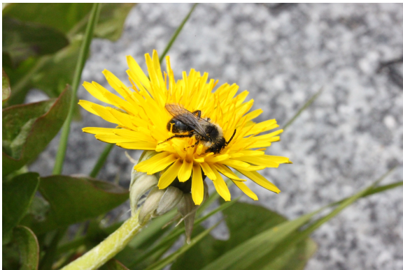
Mining Bee on a cemetery Dandelion

The upper area is being managed by regular cutting and this is quite successful with the sward being kept under control but it is studded with ground hugging wild flowers such as common daisy, creeping buttercup, dandelions and various speedwells and these are a welcome food source for flying insects.