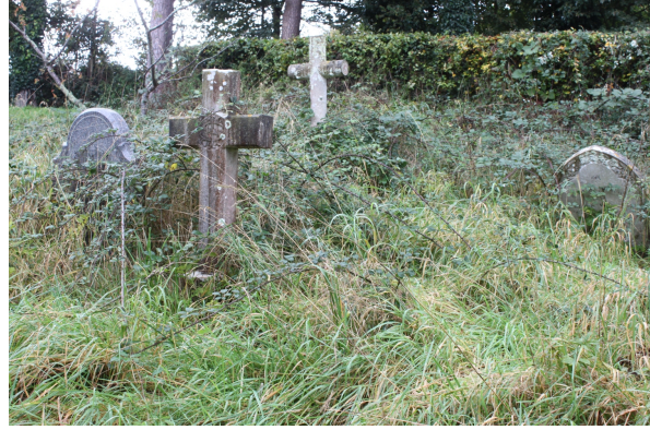
Brambles taking over

I am not sure why the plan has not been followed this year but I suspect lack of resources, personnel and equipment, will be a factor. Trying to do a hay cut requires the appropriate equipment and working around the stone monuments is even more difficult. I think this is only going to work if the maintenance team are supported by volunteers. I believe there were attempts to start a group in 2020 but these came to nothing. I welcome the VGS attempt to revive the idea and wish them luck. I am not a fan of the choice of title including the word cherishing, but I am not the audience that you are trying to reach.