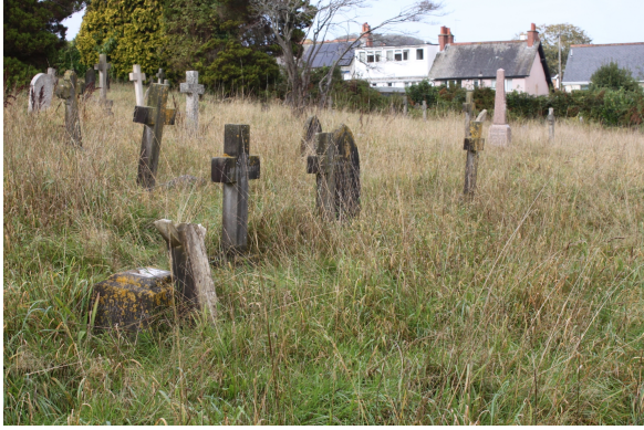
Still uncut on 29 th October